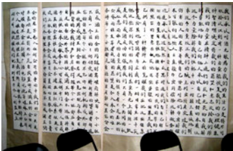
12 x 12 at a meeting in China, 2008